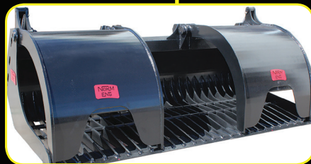
SOLID GRAPPLE ARMS SIEVE FLOOR

Talk to an expert today! www.normeng.com.au