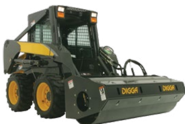
Vibratory Roller also available