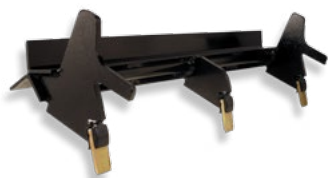
Kwik Rips also available