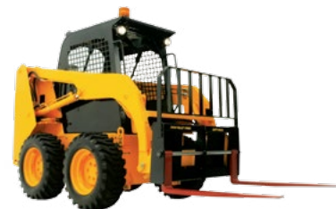
Pallet Forks also available

Contact your local professional dealer or contact Digga direct